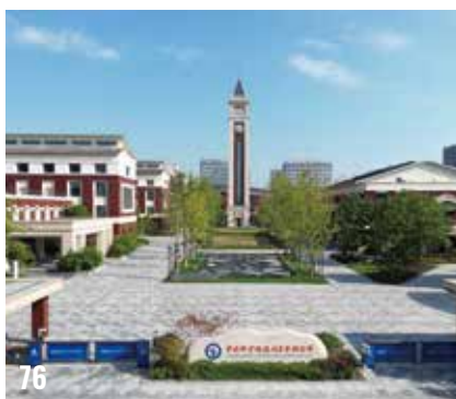
76 The Hangzhou Institute of Medicine, Chinese Academy of Sciences, marks its 5th anniversary.