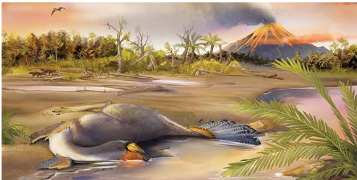
Figure 1: Reconstruction of the Jehol Biota and the well-preserved specimen of Caudipteryx.